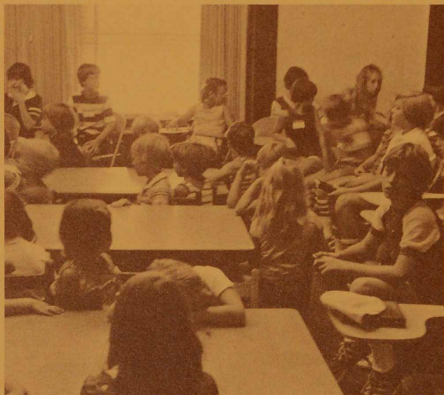
Underaged, but enjoying Covenant. Families filled many of the college facilities through the summer months.

RPC,NA (Covenanters) had their family conference the week following; and a week later, the Christian Business Men's Conference began. Earlier, nearly 700 African Methodist Episcopal guests spent a week on the Covenant campus. It was the southern-based denomination's annual Youth Congress.